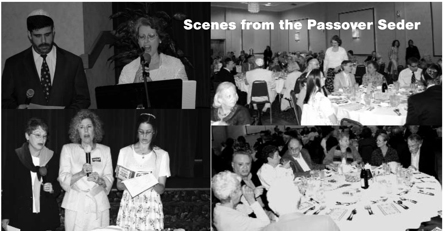
Scenes from the Passover Seder

7:30 PM. Annual Congregation Meeting. Attend and vote for officers and trustees for 2010-2011.